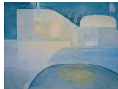
Phil Staunton "Journey Study 2"