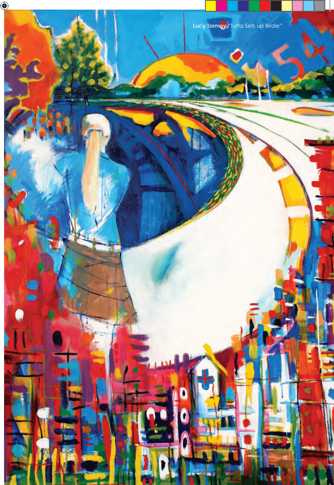
Lucy Tormey "Tutta Sets up Birdie"