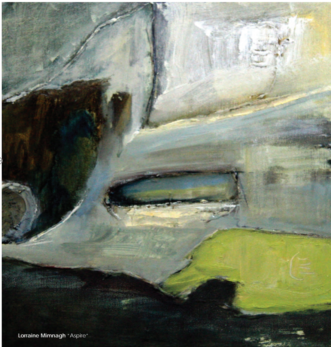
Lorraine Mimmagh "Aspire"